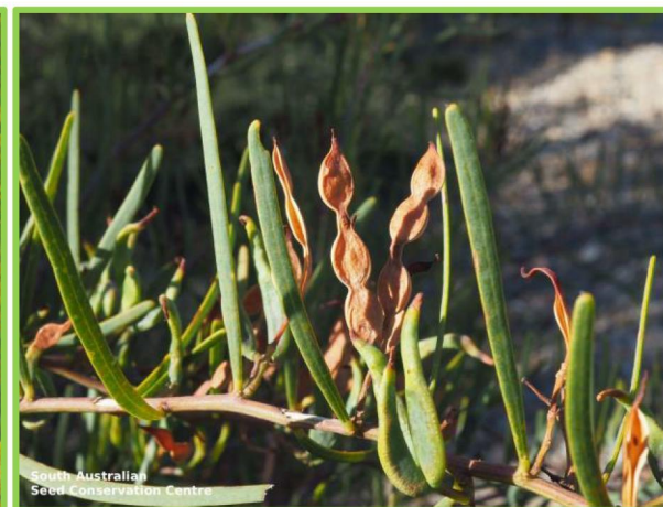
(Murfet, D, Seeds of South Australia)

Form: Ground cover Height: 0.2 – 0.3 m Spread: 2 – 3 m Flowers: Yellow Type: Globular Flowering time: Spring