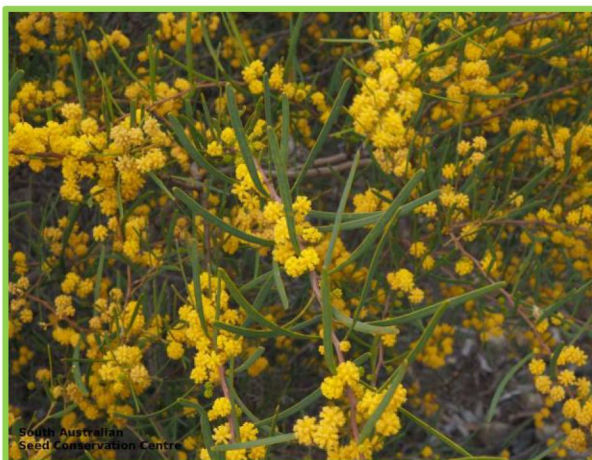
(Murfet, D, Seeds of South Australia)