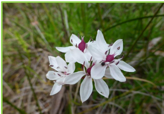
(Seeds of South Australia)