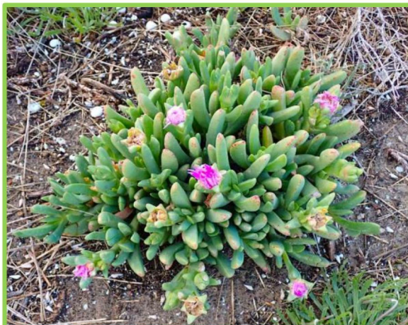
(Cox, G, iNaturalist Australia)