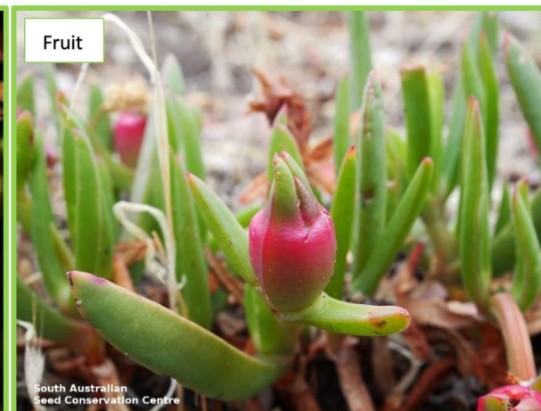
(Seeds of South Australia)

Form: Ground cover Height: 0.1 – 0.1 m Spread: 1 – 2 m Flowers: Purple Type: Open-petalled Flowering time: Spring, Winter