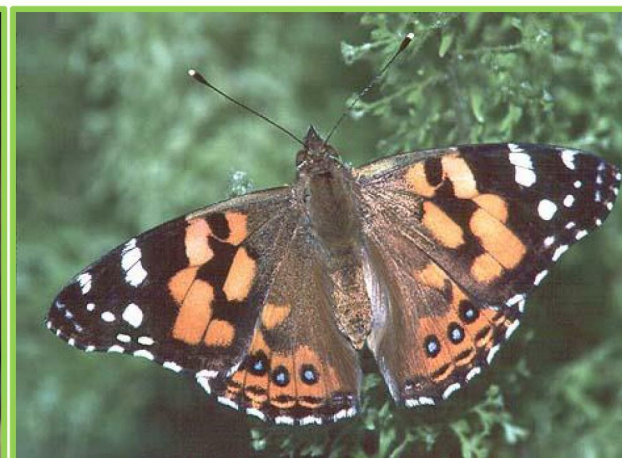
Adult Australian Painted Lady