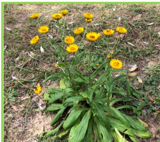
(Jashin, B, iNaturalist Australia)