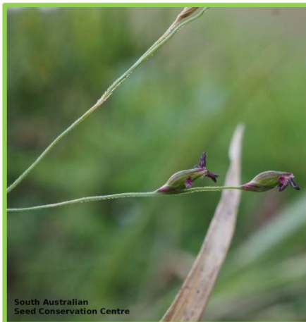
(Seeds of South Australia)