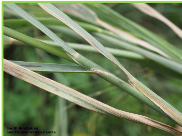
(Seeds of South Australia)