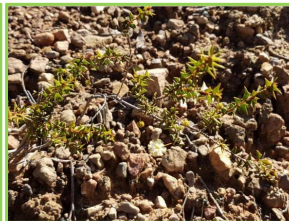
(Preston, T, Canberra Nature Map)

Form: Low shrub Height: 0.3 – 0.5 m Spread: 1 – 2 m Flowers: Yellow Type: Globular Flowering time: Spring, Winter