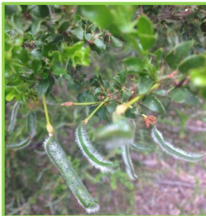
(Acacia paradoxa, Seeds of South Australia)