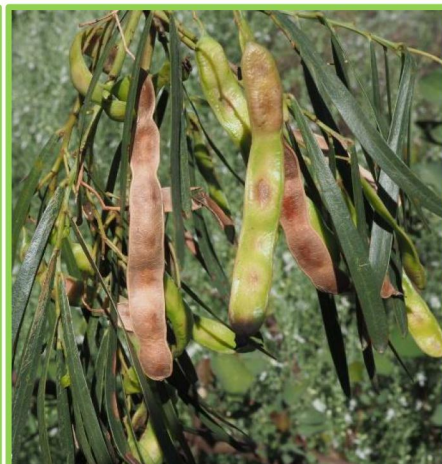
(Leshanrahan, iNaturalist Australia)