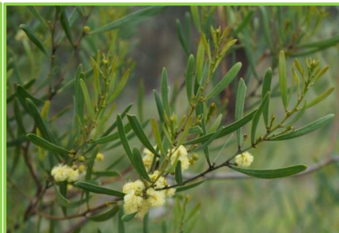
(Murfet, D, Seeds of South Australia)