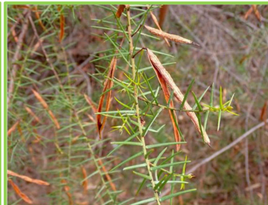
(Cox, G, iNaturalist Australia)