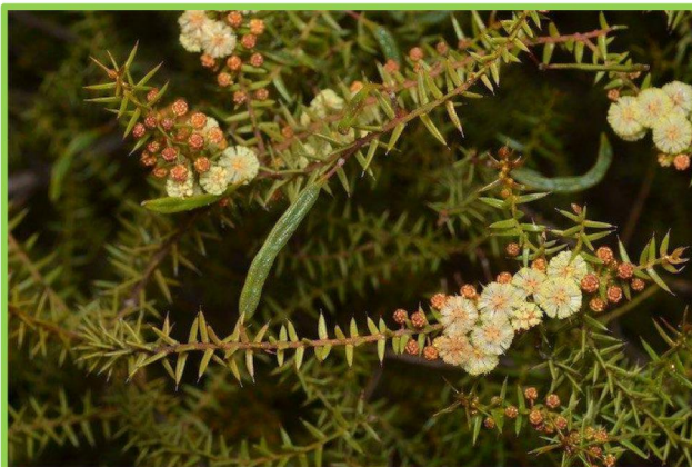
(Fagg, M, Australian Plant Image Index)