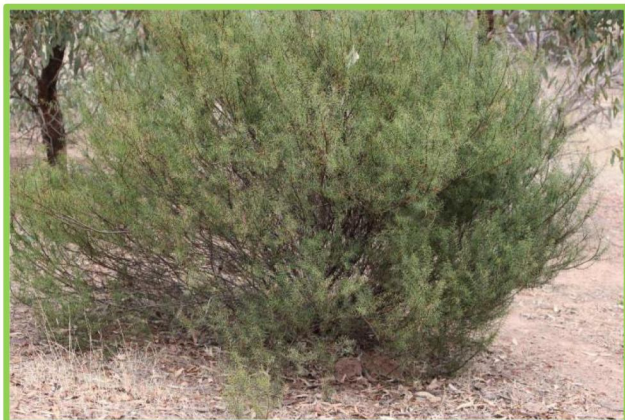
(Cox, G, iNaturalist Australia)