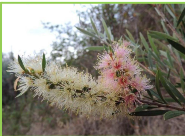
(Bedingfield, M, Canberra Nature Map)