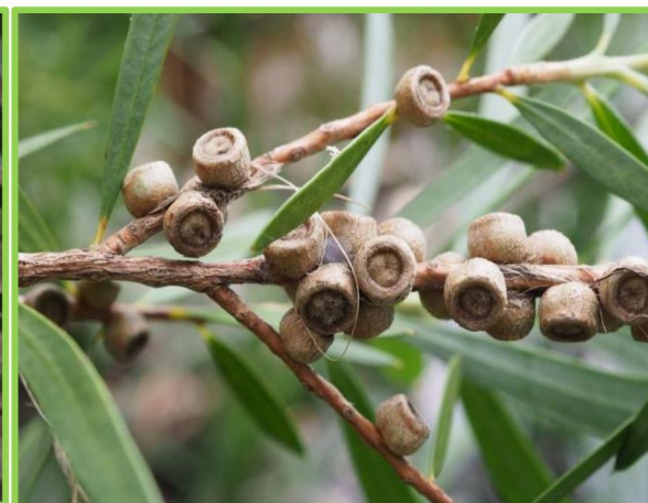
(Seeds of South Australia)

Form: Medium shrub Height: 1 – 2 m Spread: 1 – 1.5 m Flowers: Cream, Yellow Type: Bottlebrush Flowering time: Spring, Autumn