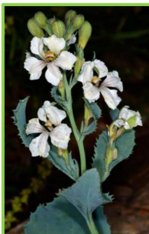
(Lindorf, C, iNaturalist Australia) (Seeds of South Australia)