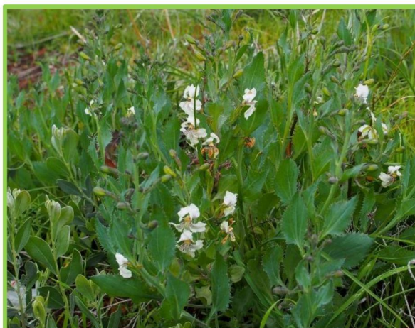
(Seeds of South Australia)